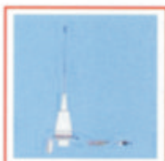
Mobile Whip Antenna 0DB , 3 DB, 6 DB 0DB