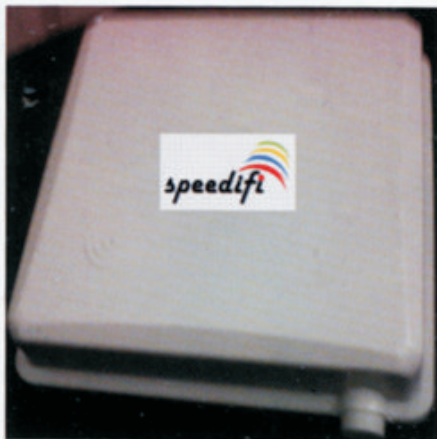
(indicative completed product as sold by retailer)