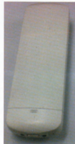
(indicative completed product as sold by retailer)

High Speed-300mbps-a/n High end Atheros Processor 15dbi Dual Polarized (2*2 MIMO) Antenna Built in DHCP , Static IP, & NAT Support Built in Firewall, Hotspot-Wi-Fi Higher Security-WEP, WPA and WPA2(Radius) encryption Multiple mode of operations like- AP, Client, Bridge, WISP Support- 10Mhz/20Mhz/40Mhz with PPPoE & VLAN 24Volt True POE Enterprise class outdoor CPE with POE Suitable for Teleco/ISP/LCO as PTP/CPE Easy Web Based Configuration and Management