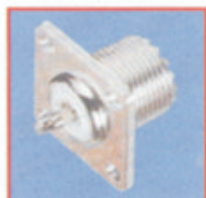
Female Panel Mount