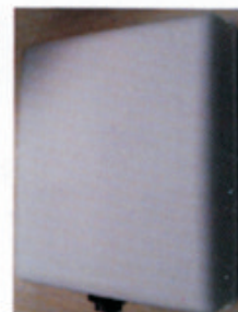
(indicative completed product as sold by retailer)

High Speed-150mbps-b/g/n High end Atheros Processor 14-16dbi Single Polarized Patch Antenna (Optional) Built in DHCP , Static IP, & NAT Support Built in Firewall, Hotspot-Wi-Fi Higher Security-WEP, WPA and WPA2(Radius) encryption Multiple mode of operations like- AP, Client, Bridge, WISP Support- 10Mhz/20Mhz/40Mhz with PPPoE & VLAN 12Volt Passive POE Enterprise class outdoor CPE with POE Suitable for Teleco/ISP/LCO as PTP/PTMT/CPE Easy Web Based Configuration and Management