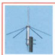
Ground Plane Antenna 0DB, 3 DB, 6 DB