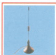
Magnetic Mount Antenna 0DB , 3 DB