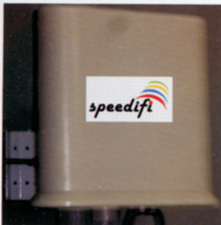
(indicative completed product as sold by retailer)