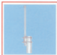
Fiber Glass Directional Antenna 3 DB, 6DB