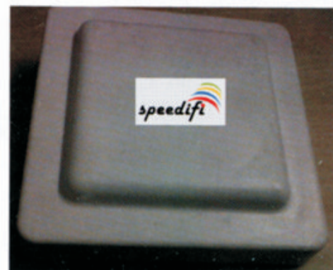
(indicative completed product as sold by retailer)

High Speed-300mbps-b/g/n High end Atheros Processor 15dbi dual polarized Patch Antenna (Optional) Built in DHCP , Static IP, & NAT Support Built in Firewall, Hotspot-Wi-Fi Higher Security-WEP, WPA and WPA2(Radius) encryption Multiple mode of operations like- AP, Client, Bridge, WISP Support- 10Mhz/20Mhz/40Mhz with PPPoE & VLAN 12Volt Passive POE Enterprise class outdoor CPE with POE Suitable for Home/Campus/Society/Corporate as AP/PTP/PTMT/CPE Easy Web Based Configuration and Management