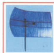
Grid Parabolic Antenna 21DB, 24DB, 27DB, 31DB