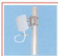
Flat Panel / Patch Panel Antenna 8DB, 12DB, 15DB, 18DB