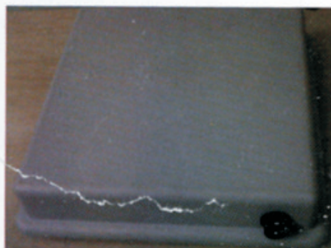
(indicative completed product as sold by retailer)

High Speed-150mbps-a/n High end Atheros Processor 22dbi Single Polarized Patch Antenna (Optional) Built in DHCP , Static IP, & NAT Support Built in Firewall, Hotspot-Wi-Fi Higher Security-WEP, WPA and WPA2(Radius) encryption Multiple mode of operations like- AP, Client, Bridge, WISP Support- 10Mhz/20Mhz/40Mhz with PPPoE & VLAN 12Volt/18volt/24Volt Passive POE Support Enterprise class outdoor CPE with POE Suitable for Teleco/ISP/LCO as PTP/PTMT/CPE Easy Web Based Configuration and Management