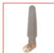
Heliflex Antenna 0DB