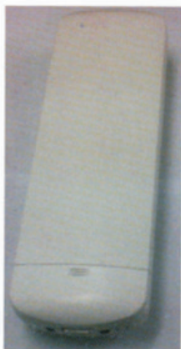
(indicative completed product as sold by retailer)